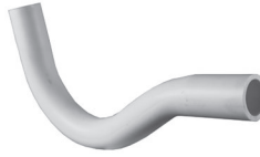
Part No. PVC 2700 Condensate P Trap (SPG x SPG)